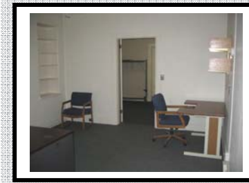
Room 212, McCallum Bldg 2 nd Floor